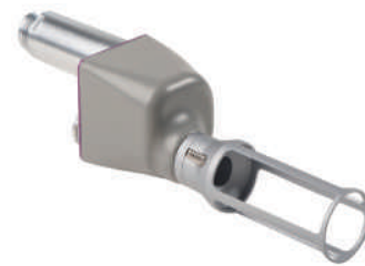
Figure 1. LiteScan Scanner

The Alma CO 2 laser with its scanner, LiteScan, provide high-precision and char-free tissue ablation, with well controlled layer by layer vaporization enabling minimal damage to the surrounding tissue (Figure 1)