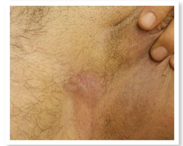
Figure 5. Condyloma 1 month following laser treatment. Almost cured.