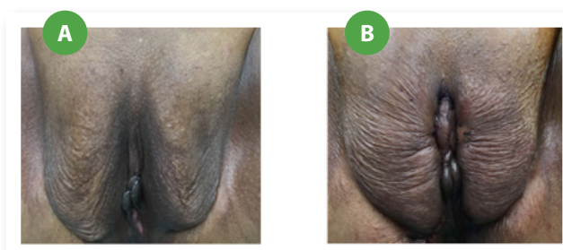
Figure 3. Labia majora before (A) and after (B) CO 2 laser-based labia majora remodeling.