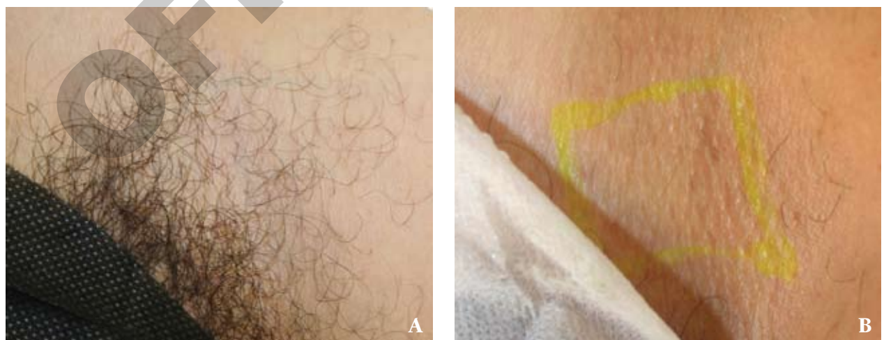
Figure 2. The bikini area of a 44-year-old female before treatment (A) and at 6-month follow-up (B) who achieved an 84.8% reduction in hair counts after 5 treatments with the 810-nm diode laser.

For a laser or light-based device, treatment time is determined by the coverage rate, which is the product of the area of the spot and the repetition rate. 26,27 In our study, the 810-nm diode laser spot was rectangular, measuring 12×10 mm, so the area of the spot was 120 mm 2 . Since the repetition rate was 3Hz, the coverage rate is 360 mm 2 /s. The coverage rate of a comparable 800-nm diode laser device used for hair removal may be similarly calculated. In the study of Lou et al, 13 the spot of the 800-nm laser device was square shaped, measuring 9×9 mm. Since the maximum repetition rate of this device is 2 Hz, 5 the coverage rate is 162 mm 2 /s, less than half of the coverage rate of the 810-nm diode laser used in the present study. A square spot measuring 12×12 mm,