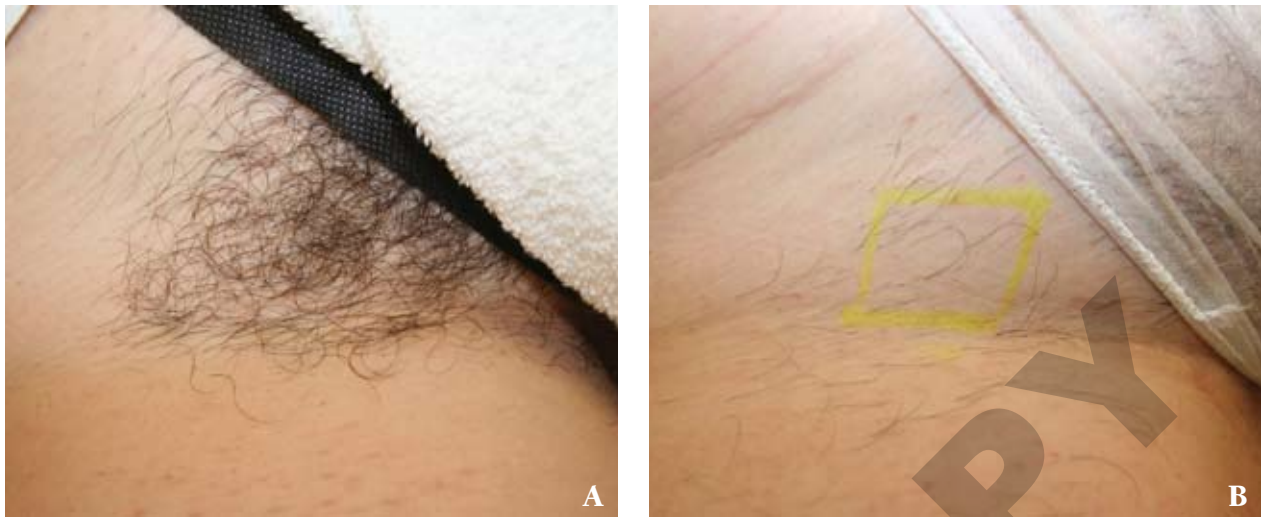
Figure 3. The bikini area of a 42-year-old female before treatment (A) and at 6-month follow-up (B) who achieved an 87.9% reduction in hair counts after 5 treatments with the 810-nm diode laser.

or 144 mm 2 , has also been used in published studies of the 800-nm diode laser. 5 With this larger spot, the coverage rate increases to 288 mm 2 /s, which is still lower than the 360 mm 2 /s of the 810-nm device. The shorter treatment time is an even greater advantage when the 810-nm diode laser is used to treat body areas larger than the bikini area, such as the back and legs.